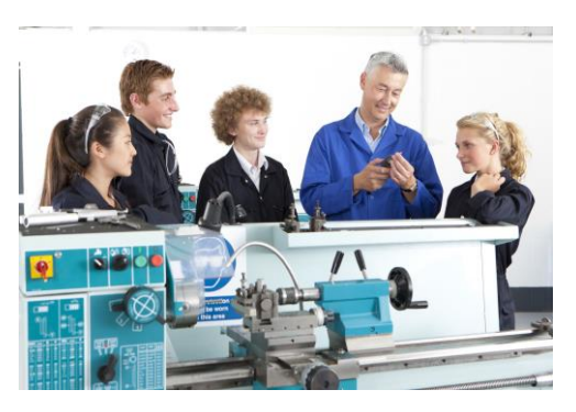
Vocational education and training