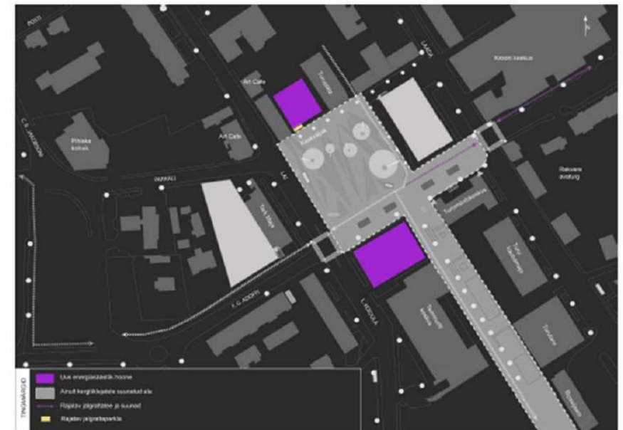
Etapi peamiseks eesmärgiks on kujundada olemasolev linnaruum veelgi sidusamaks ning kasutajasõbralikumaks.